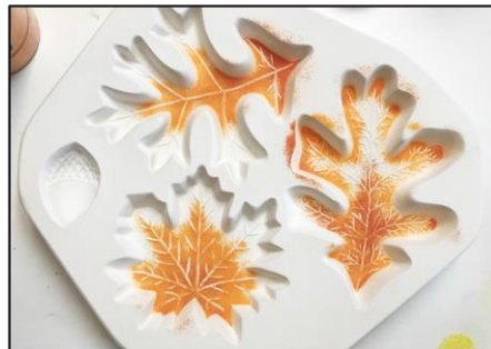
Sift F1 Orange Opal over the Flame Opal and further out into the leaves.