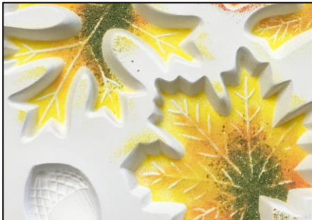
Place some F2 Olive Green here and there in a few of the leaves.