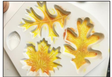
Sift F1 Sunflower Opal over the Orange Opal and further out into the leaves.