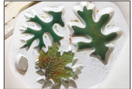
Fire using the schedule in Table 1 or your own preferred Tack Fuse.