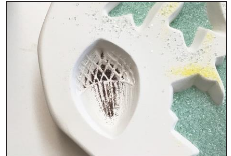
Sift F1 Black in the low areas of the acorn.