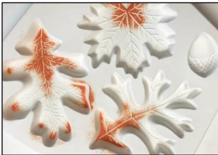
Sift F1 Flame Opal in the leaf bases and along the veins of the leaves.

Before beginning, make sure to thoroughly treat your molds with glass separator. If using spray-on separator and/or powder frits, always remember to wear a mask.