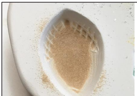
Sift F1 Chestnut over the Black.