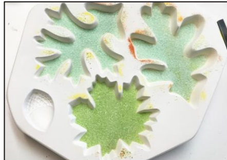
Fill the rest of each leaf with F2 Amazon Green or F2 Pastel Green until each leaf holds about 28g.