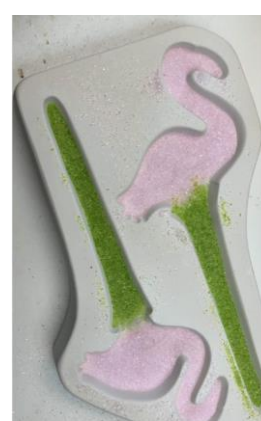
Place fine Spring Green Trans. frit in the entire grass area. Fill all raised areas of the mold in this area.