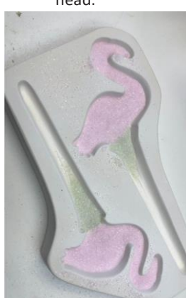
Add fine Artichoke Opal frit over the top of the grass.