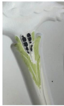
Place powdered Pea Pod Opal in the top areas of the grass around the legs.