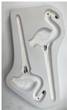
Begin by sifting powdered Black frit in the beak, eyes and legs.