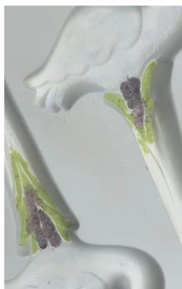
Add fine Dusty Lilac Opal frit over the black in the legs.