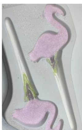
Place fine Petal Pink Opal frit over the body, neck, and head of the flamingo, covering all of the raised areas in this part of the mold.