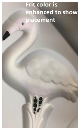
Place powdered Salmon Pink Opal frit in the head and belly.