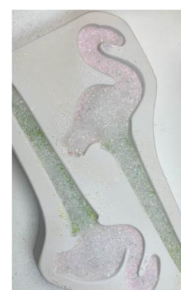
Fill the mold cavity with medium Clear frit. The Small Flamingo should weigh 105 grams and the Large Flamingo 120 grams. Fire the project to a Full Fuse using the suggested schedule in Table 1 or your own preferred Full Fuse