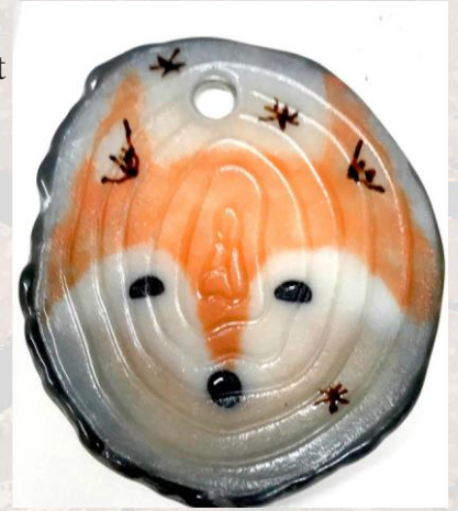
The image above shows the liquid gold applied to the Fox ornament before firing.

Liquid fired gold/white gold consists of actual precious metals in a metallic “overglaze” form and yields the light brilliance of real gold/white gold when fired. They Contains 5%-10% real gold and the price of the product will reflect this. They are typically sold in 2 gram containers. A little bit of product goes a long way. Overglaze liquid fired gold can be applied using a brush or for more precise control, use a gold applicator pen. Work in a clean, dust-free area with good ventilation. Clean the glass thoroughly of any oils or glass separator that remains on the surface. To mature the gold/white gold, fire at 350/hour to 1250 degrees with a five minute hold. The overglaze will also mature using a standard slump schedule consequently glass can be slumped and the gold matured in the same firing. Ventilation is crucial because the overglaze has a strong smell before and during firing. For more information contact the manufacturer.