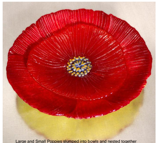
Large and Small Poppies slumped into bowls and nested together