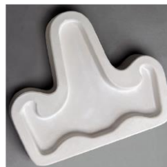
LF253 Large Easel