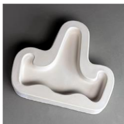
LF252 Small Easel