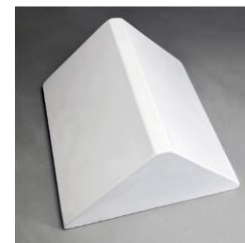
GM277 Angle Drape