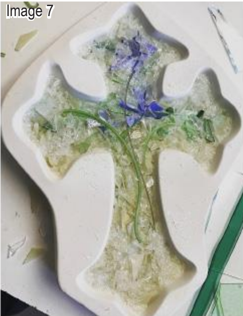
Table 1 - Full Fuse