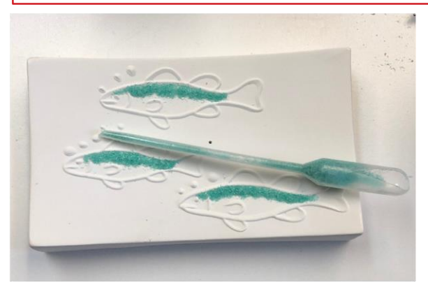
Use a pipette to place some F2 Teal Green Trans onto the top of the fishes body.

Spray your mold with a suitable glass separator. We reccomend ZYP.