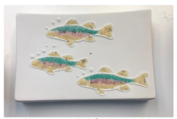
Sprinkle some F2 Black frit here and there on the fish bodies.