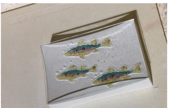
Cut a 5.75" x 3.5" rectangle out of 3m clear fuse-able sheet glass and place it on the mold in your kiln. Fire using the schedule found in table 1.