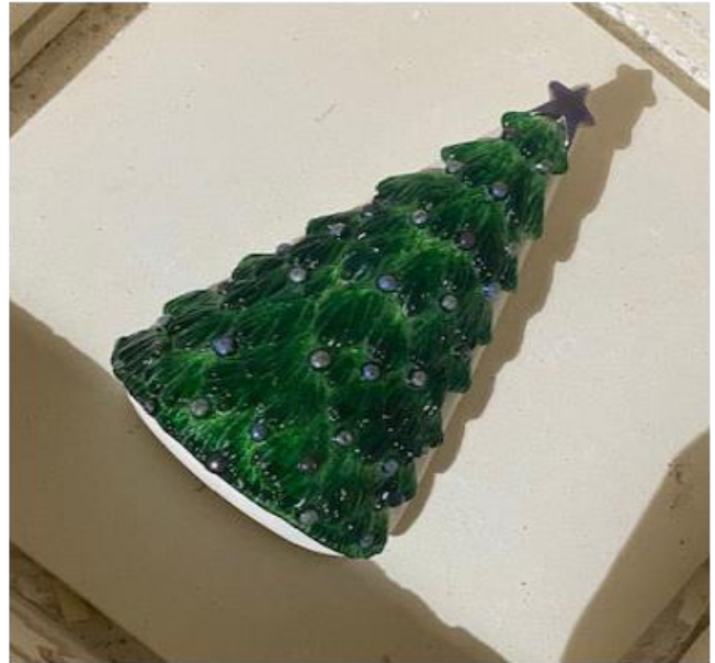
Fire the glass on the drape using a drape firing schedule 2.