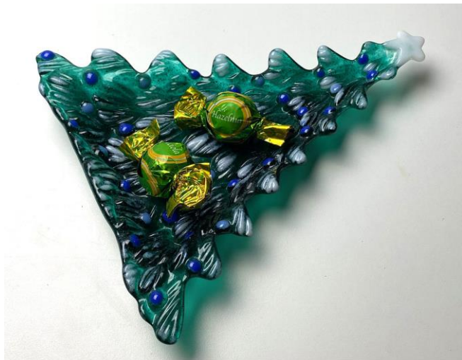
Christmas Tree slumped on GM268 Triangle Slump Mold. Slumped using the suggested schedule in Table 3.