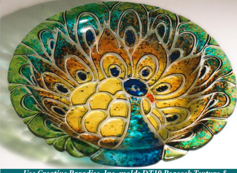
Use Creative Paradise, Inc. molds DT19 Peacock Texture & GM66 Shallow Bowl with fusible glass to make a stunning fused, textured, and slumped glass peacock bowl.

Begin by treating the molds well with suitable glass separator. We recommend using spray-on ZYP. Remember to always wear a mask when applying spray-on separator.