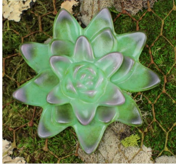
COE96: - F1 Mauve Opal - F1 Crystal Opal - F2 Olive Opal - F2 Pastel Green Opal - F3 Amazon Green Opal