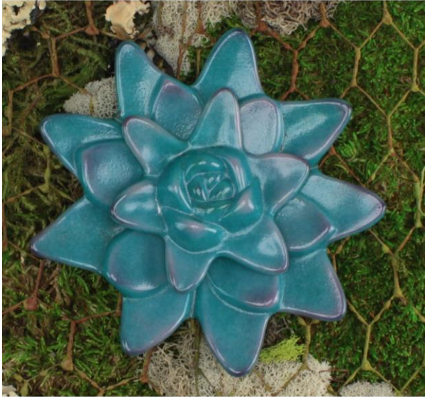
COE96: - F1 Lilac Opal - F1 Mauve Opal - F2 Apple Jade Opal