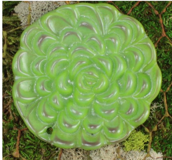
COE96: - F1 Mauve Opal - F1 Lilac Opal - F2 Amazon Green Opal