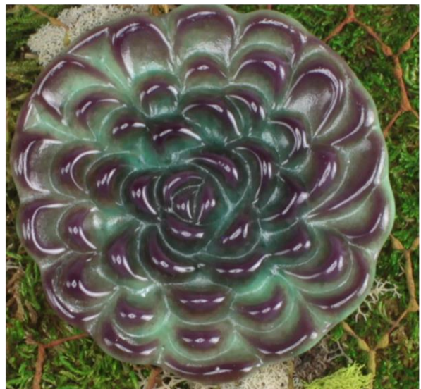
COE96: - F1 Turns Pink Trans. - F2 Pale Purple Trans. - F2 Apple Jade Opal - F2 Pastel Green Opal