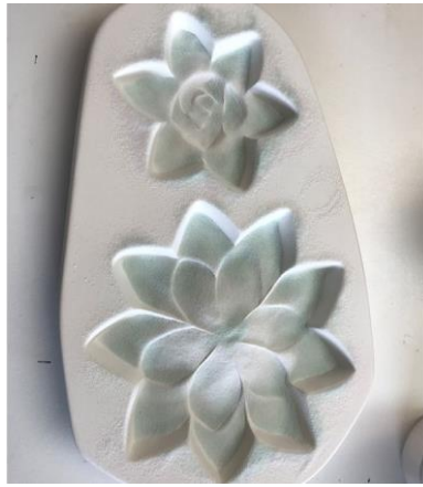
Step 3: Sift F1 Pastel Green Opal along petal edges.