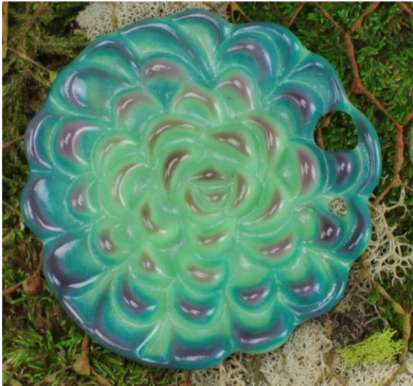
COE96: - F1 Lilac Opal - F1 Peacock Green Opal - F2 Pastel Green Opal