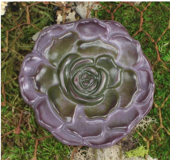
COE96: - F1 Plum Opal - F1 Sea Green Trans. - F2 Olive Opal - F2 Lilac Opal