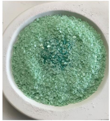
Step 4: Fill with F3 Pastel Green Opal until holding 85 grams.