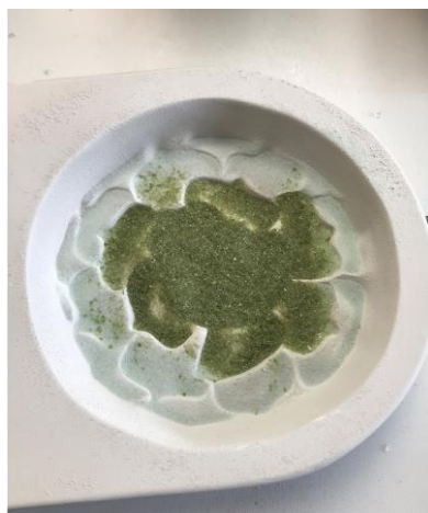
Step 3: Place F2 Olive Green Opal into the center.