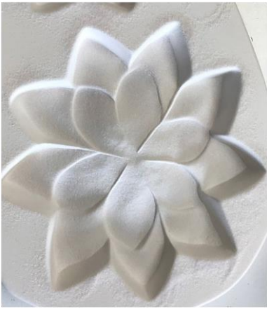
Step 2: Sift F1 Crystal Opal over the whole succulent.