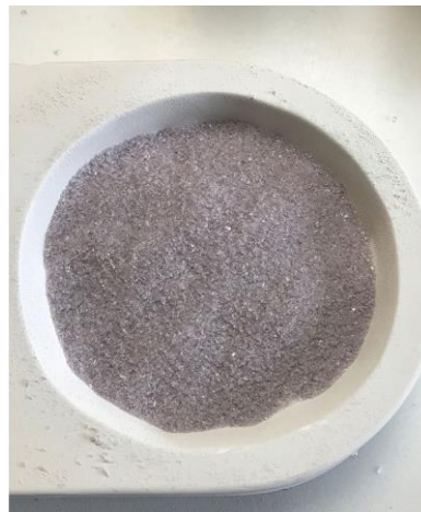
Step 4: Back with F2 Lilac Opal until holding 110 grams.

Once full, fire the mold with Succulents 2 and 3 to a Full Fuse using the suggested schedule in Table 1 on Page 2 or your own preferred Full Fuse.