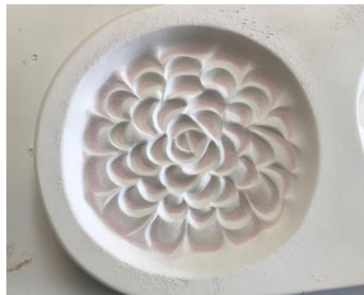
Step 1: Sift F1 Turns Pink Trans. into the lowest parts of the succulent.

- Always wear a mask when using spray-on separator and/or powder frits.