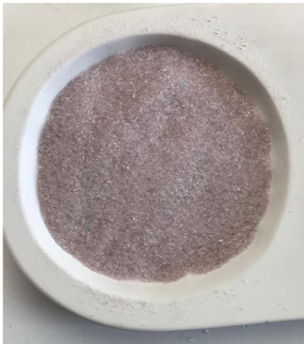
Step 2: Back with F2 Pale Purple.