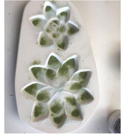
Step 4: Place F2 Olive Opal in the edges of the petals.