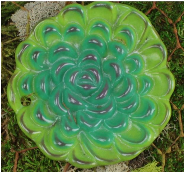
COE96: - F1 Lilac Opal - F1 Peacock Green Opal - F2 Amazon Green Opal