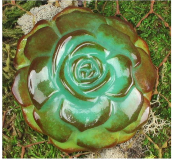
COE96: - F1 Rust Trans. - F1 Peacock Green Opal - F2 Amazon Green Opal