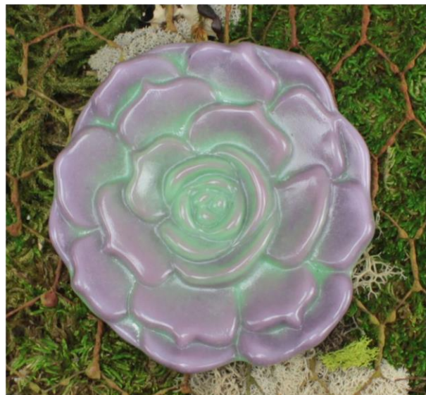
COE96: - F1 Mauve Opal - F1 Lilac Opal - F2 Pastel Green Opal