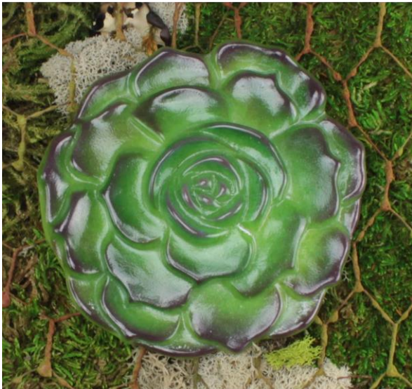
COE96: - F1 Plum Opal - F1 Olive Opal - F2 Amazon Green Opal