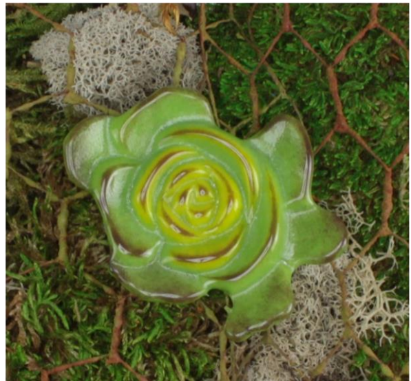
COE96: - F1 Turns Pink Trans, - F1 Lemongrass Opal - F2 Amazon Green Opal - Filled to only 20g