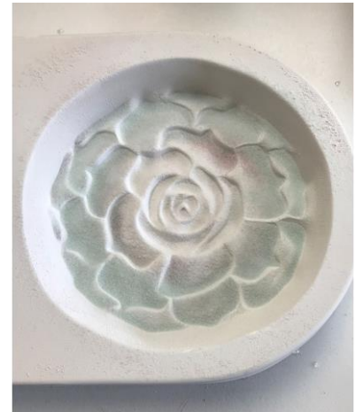
Step 2: Sift F1 Sea Green Trans. into the petals around the outer edge.