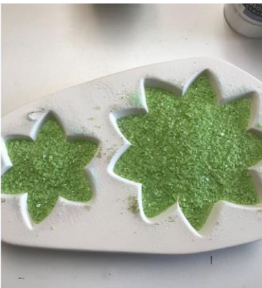
Step 5: Back each succulent with F3 Amazon Green until the Large holds 90 grams and the Small holds 36 grams.

Once filled, fire to a Full Fuse using the suggested schedule in Table 1 below or your own preferred Full Fuse schedule.