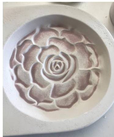
Step 1: Sift F1 Plum Opal into the lowest areas, focusing more on the petal edges.