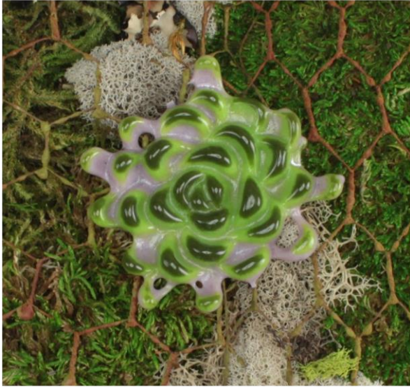
COE96: - F1 Olive Green Opal - F1 Amazon Green Opal - F2 Lilac Opal - Filled to only 32g