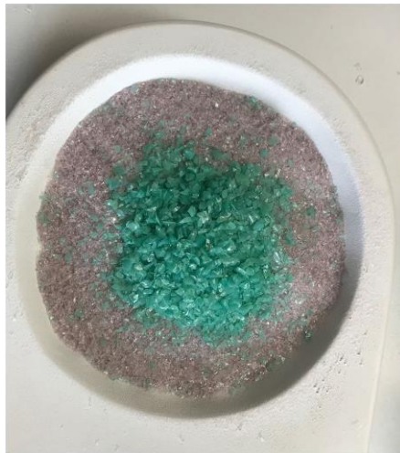
Step 3: Place F2 Apple Jade Opal into the center.