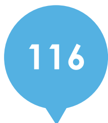
DEEP SKY BLUE