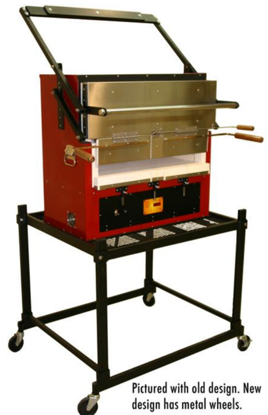
Pictured with old design. New design has metal wheels.

The stands are constructed of heavy duty square tubing and are equipped with high quality locking metal wheels (won't develop flat spots if they sit too long). It also has a convenient, built in, expanded metal tray that will catch falling glass and provides a place for your tools.