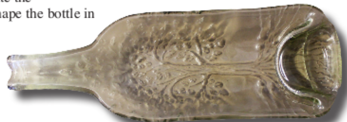
750 ml wine bottle fired on GM159 Tree Of Life Slump