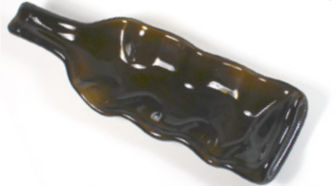
750 ml wine bottle fired on GM190 Fluted Bottle Slump