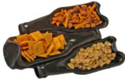
Three 12 ounce beer bottles fused together and slumped in GM99 Three Bottle Slump