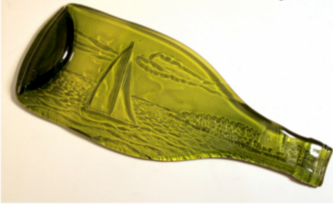
750 ml wine bottle fired on DT26 Sailing Texture