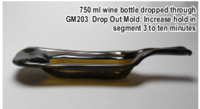
750 ml wine bottle dropped through GM203 Drop Out Mold. Increase hold in segment 3 to ten minutes