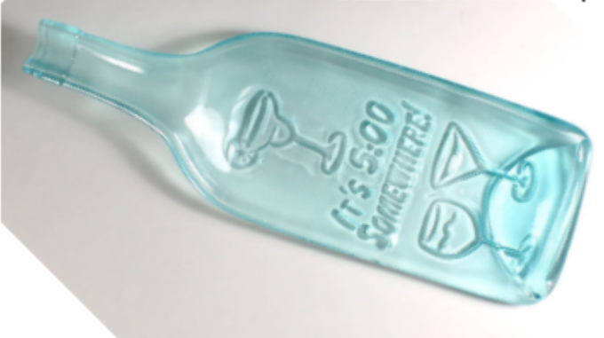
1.5 l wine bottle fired on GM177 Five O'Clock Somewhere Bottle Slump