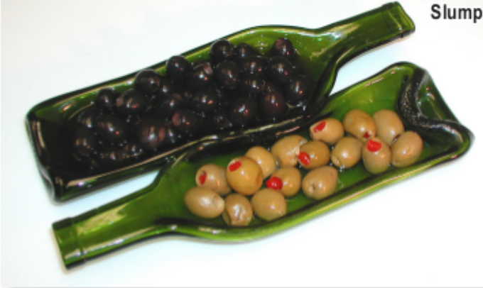
Two 750 ml wine bottles fired on GM65 Double Bottle Slump