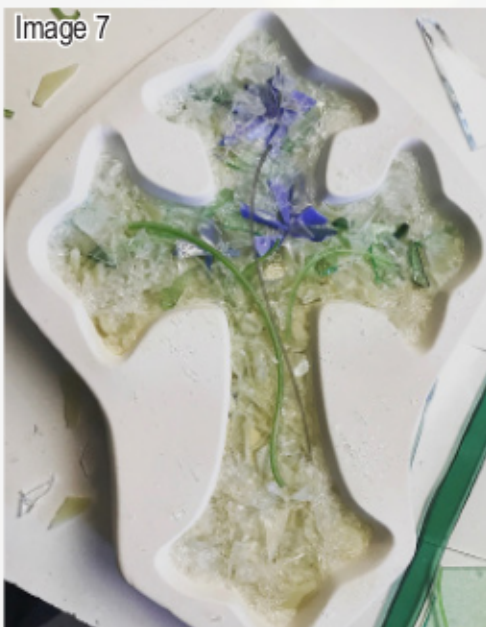
Table 1 - Full Fuse